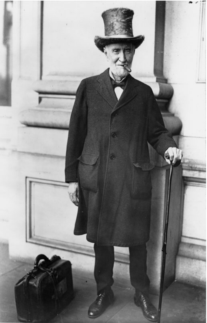
1. Joseph G. Cannon, the powerful Speaker of the House from 1903 to 1911.