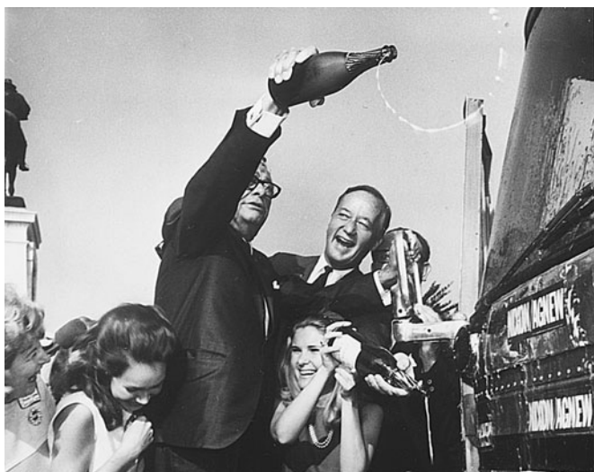
3. Campaigning can be joyous as well as arduous. Here Senate minority leader Everett M. Dirksen (R-Illinois) and Charles Mathias (R-Maryland) christen a campaign bus at the Capitol in 1968.

restriction on free speech, while proponents argued that unlimited individual spending favored the independently wealthy. Money talks, and those with more can talk more loudly.